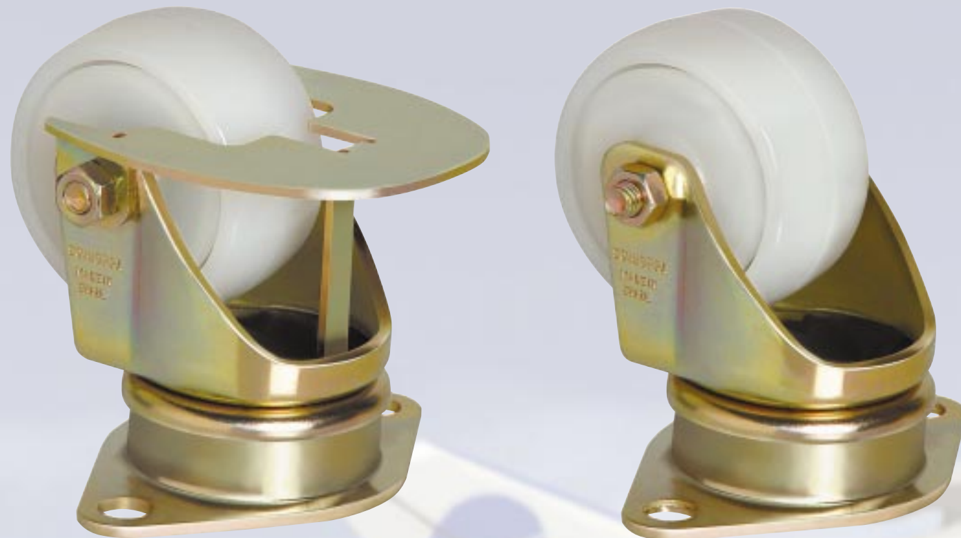
Cargo Sky® with Thread Guard

Cargo Sky® Line is designed for handling and transporting loads under both extreme environmental conditions, and lighter applications.